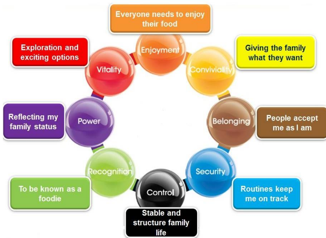
Figure 2 - Censydiam model

A Censydiam approach was used to understand participants’ motivation in relation to various food and health behaviour. Various positions on the Censydiam wheel represent different motivations for behaviour. The wheel is focused on the theoretical viewpoint that consumers are driven by two main forces, the personal (north/south) and the social (east/west) dimensions. The remaining motivations combine elements of the social and personal dimensions. These are briefly described below in Figure 2.